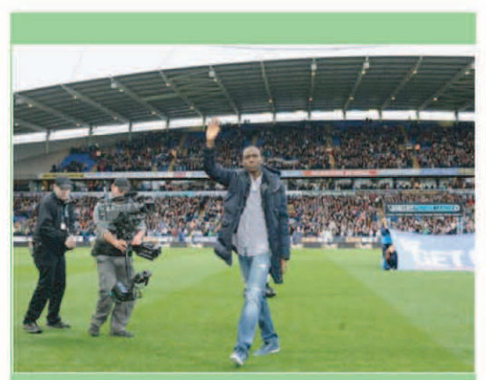
Mr Incredible: Muamba attended Bolton's home match on 2 May after a miracle recovery, where he expressed his gratitude for the support he had received